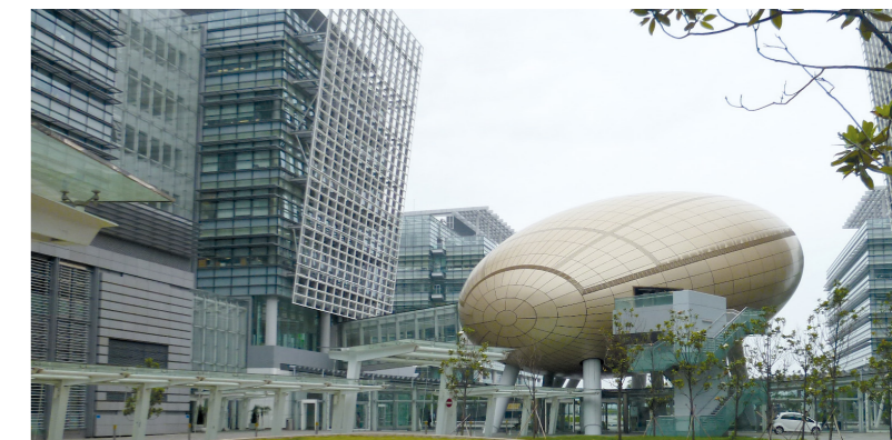
The Hohenstein laboratory is located in the Hong Kong Science Park: the address for excellence and innovation.